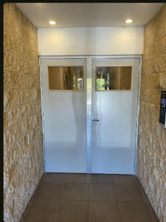
Shale Grey · Half Light · Chadstone