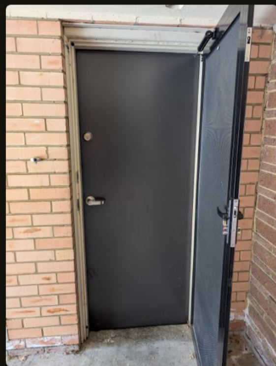
Monument · Chadstone