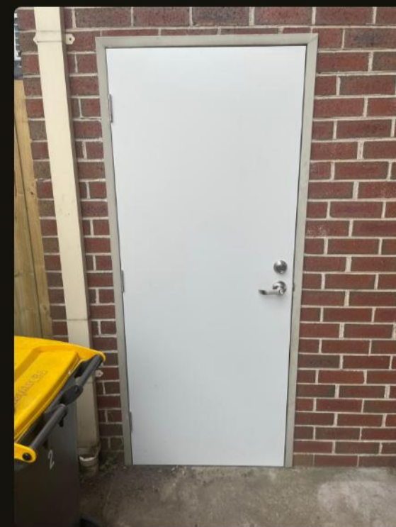
Surfmist · Clayton