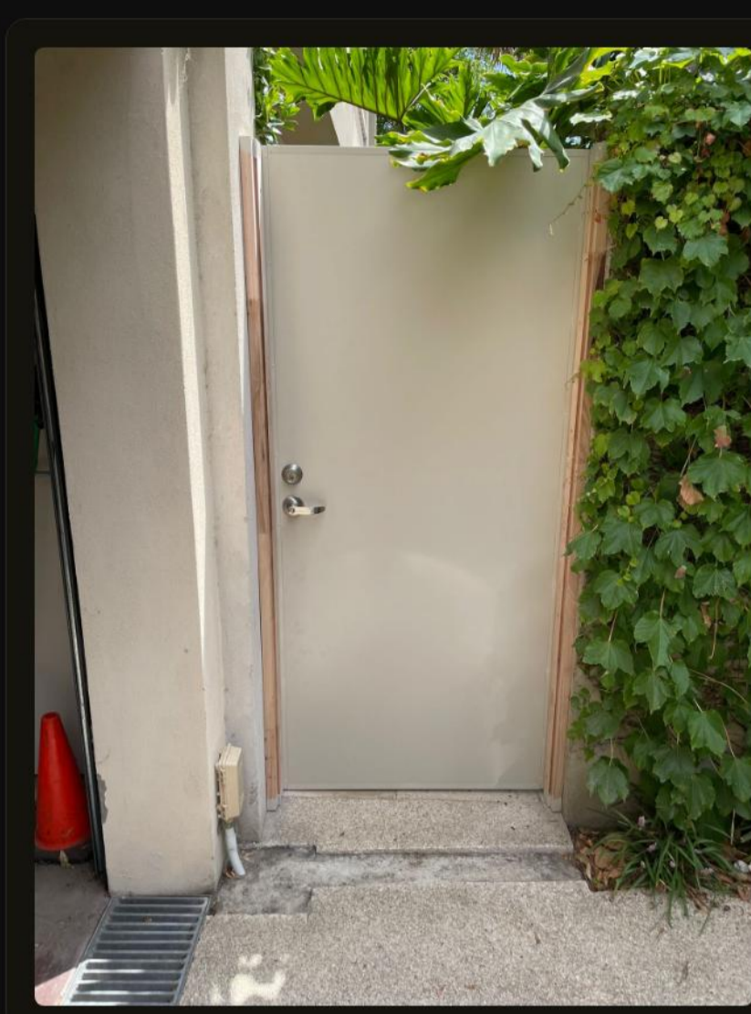
Real Install · StormBloc in Surfist · Armadale

Colorbond® steel both faces · RotGuard™ moisture-resistant edges · engineered weather-resistant core · standard 820 × 2040, or made to your opening.